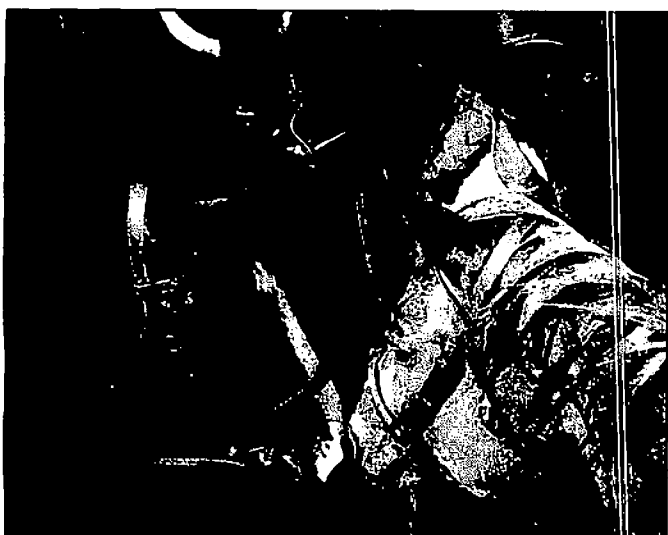
3 thirsty equines sample the water at Blydenburgh County Park