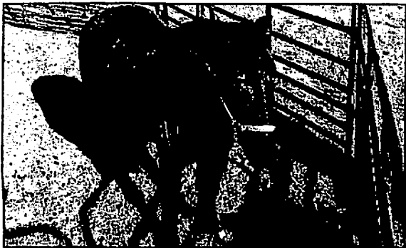
Twister Toth visiting at Hallockville.

April 24, Saturday - Spring trail ride at Hallockville. 9:00a.m. assembly, 10:00a.m. start. Tail gate lunch at 12:30p.m. Bring a dish to share.